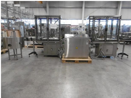
SERAC GAIA filling & closing line