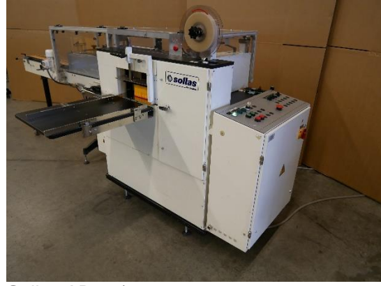
Sollas AB 25/50

Please contact us for more detailed information: