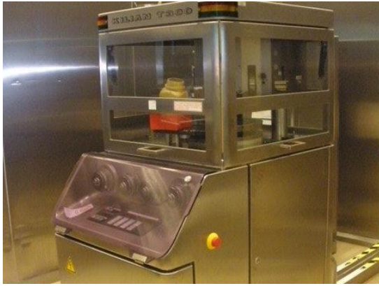
Kilian T300/32 EU-B