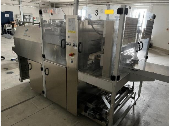
Pester PEWO-pack 800