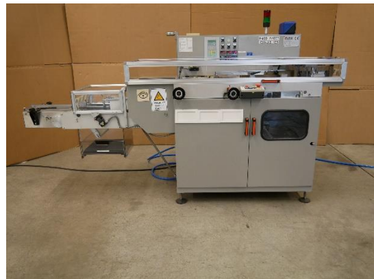
BFB (IMA) model 3791AM