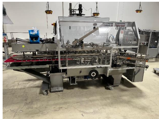
CAM AV vertical cartoner