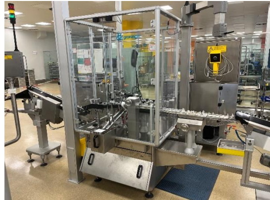
Groninger SMB 18005