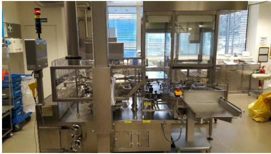
Groninger vial line

6. Fette PT 3090 double layer rotary tablet press, 61 stations (EU-19), pre-compression 100 kN, main compression 100 kN, capacity 109,800 - 585,600 tabl./ h, excellent working condition with less than 7,000 running hours, details+video