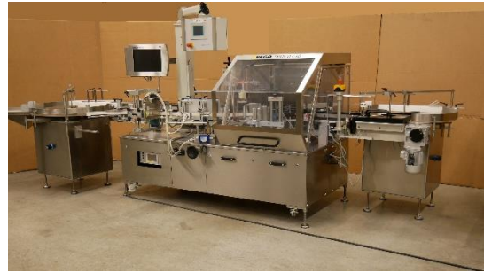
Pago System 610